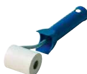
ROLLER page 326