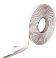
SUPRA BAND page 132