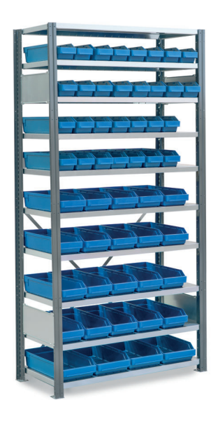
Shelving with plastic bins