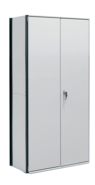
Shelving with door section