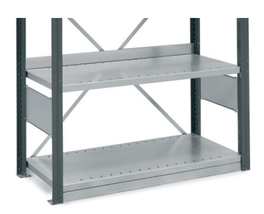
Base plinth and Front/Back stop