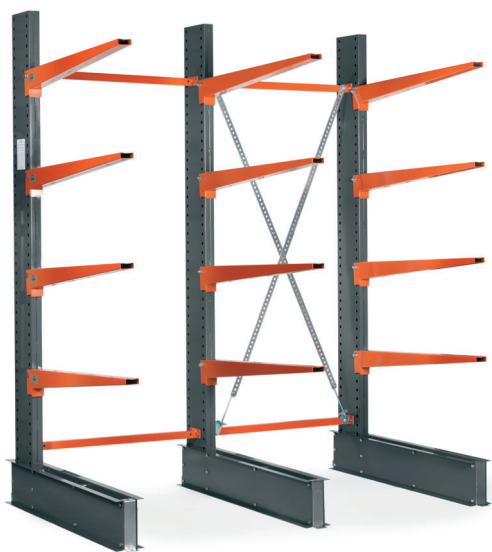
Cantilever Racking Light model

Durability is a distinguishing characteristic of EAB. Our attention to detail and quality thinking are part of everything we do from selecting material to manufacturing, delivery and assembly. Durability also includes the relationships we have with our customers, suppliers and employees.