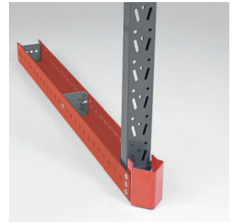
Reinforced bottom profile with guide for trucks.