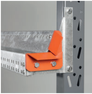
Bracket with guide