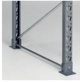
Sleeve footplate standard